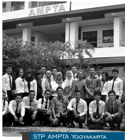
STP AMPTA YOGYAKARTA