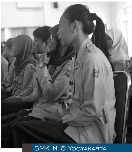
SMK N 6 YOGYAKARTA

In order to meet the ASEAN Community 2015, ASEAN Studies Center Faculty of Social and Political Sciences conducted ASEAN Community 2015 Awareness Building Program to STP AMPTA Yogyakarta and SMK Negeri 6 Yogyakarta. The two schools were selected as its students are the most affected parties according to Mutual Recognition Arrangement in service sector. In this program, the enthusiasm of the students was very high and the two schools wished for continuation of such program.